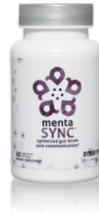
MentaSync for the axis

*THESE STATEMENTS HAVE NOT BEEN EVALUATED BY THE FOOD AND DRUG ADMINISTRATION. THIS PRODUCT IS NOT INTENDED TO DIAGNOSE, TREAT, CURE, OR PREVENT ANY DISEASE.