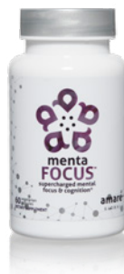
MentaFocus for the brain