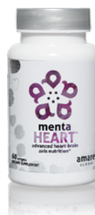
MentaHeart for the heart