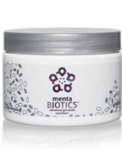
MentaBiotics for the gut